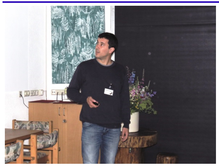
Rodolphe Rougerie: DNA barcoding and DNA metabarcoding as tools for rapid inventory and high-throughput identification of Lepidoptera