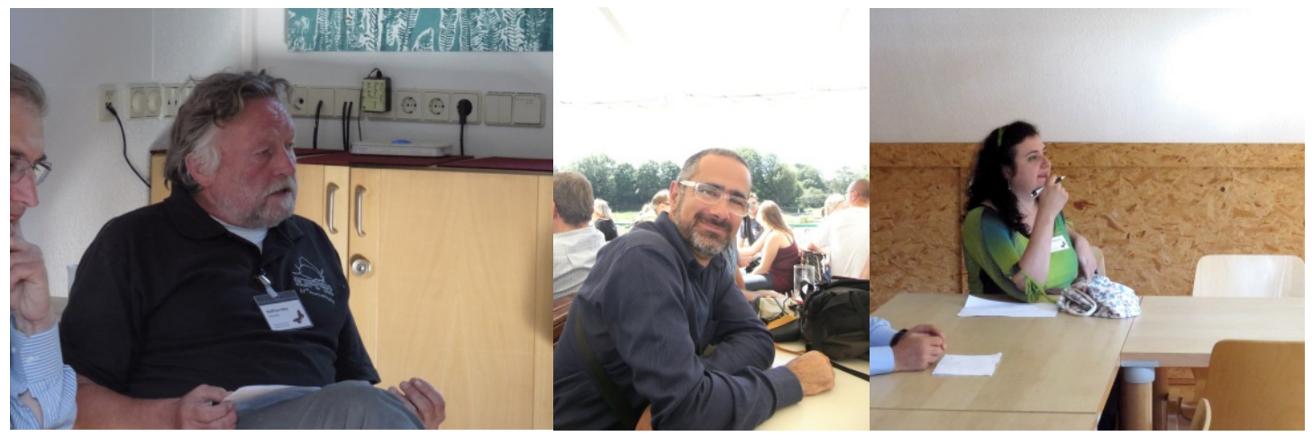
Wolfram Mey: Family ranking in Lepidoptera communities in southwestern Africa: are Geometridae statistically important?