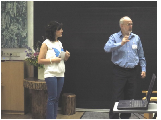
of the Amanos mountains in southern Turkey with a review of the historical exploration