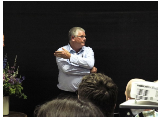
Hermann S. Staude: Accelerating the inventory of Lepidoptera early-stages and host-plant & other associations, by using citizen-science projects