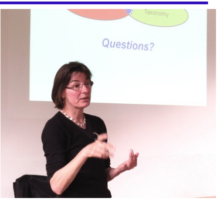
Ellinor Michel: Global Digital Infrastructure for Biological Nomenclature and Taxonomy