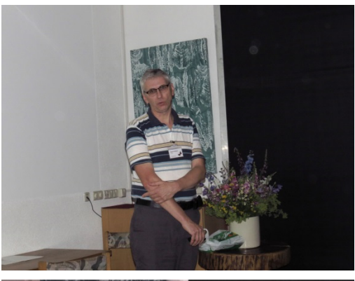
Evgeny A. Beljaev: Molecular and morphological phylogenies in geometroid lepidopterans (Insecta: Lepidoptera: Geometriformes) – discordant or concordant