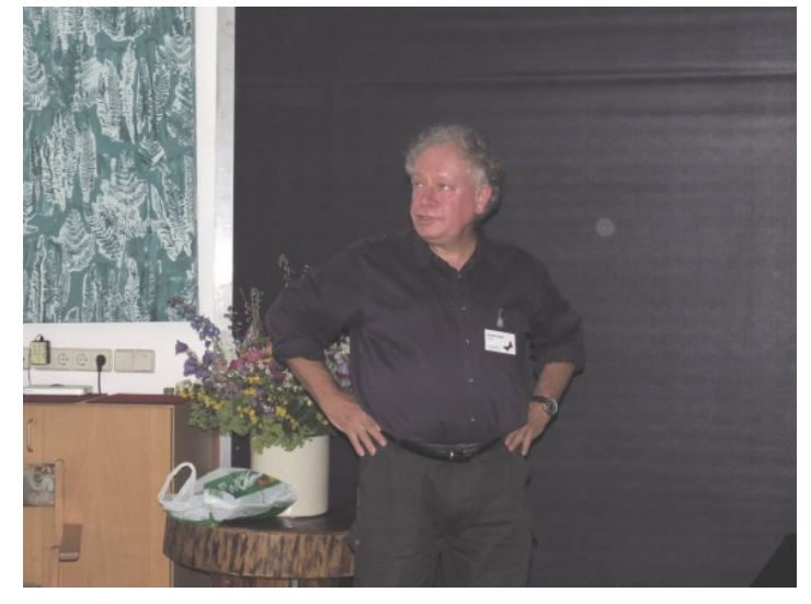
Claude Tautel: A complex diversity of taxa behind one species: Lophophelma luteipes Felder, 1875